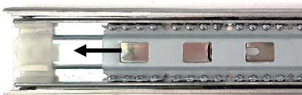
Slide the ball bearings forward

STEP 4: To reconnect the slides, slide the bearing to the front.