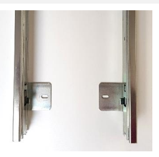
STEP 1 : Place slides on a fixed shelf (if adjustable you will need to lock it down).