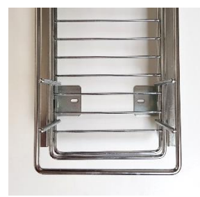
STEP 2: Place basket onto the slides. Position it 3 spaces back from the front (as pictured). You can clip them into the hooks,