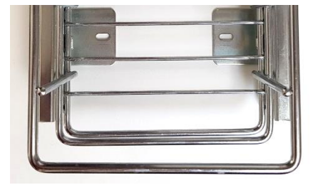
STEP 3: Position the basket on the shelf as you require. Using a pencil mark the screw holes on each slide. Drill holes and screw into position.